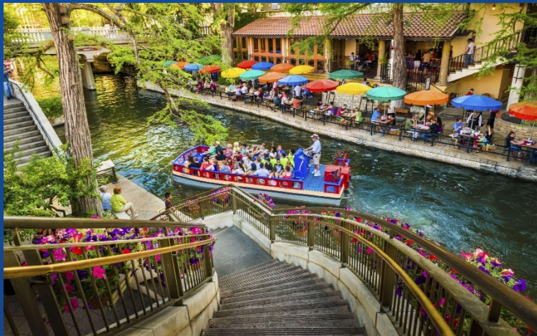
San Antonio River Walk