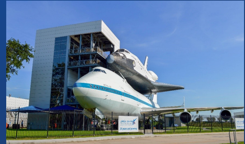
Johnson Space Center