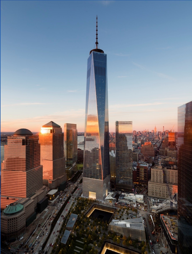
Freedom Tower, NY