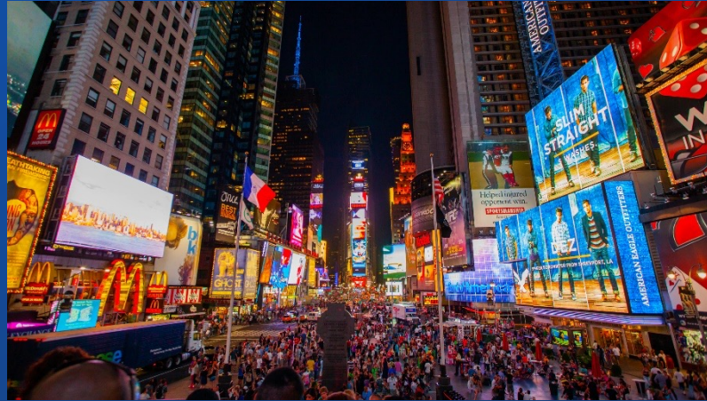
Times Square. NY